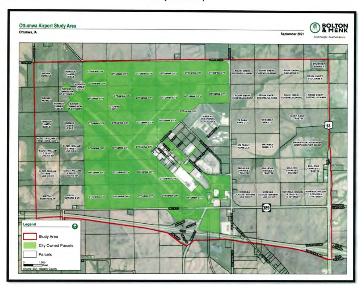
Study Area Map

The goal of this project is to ensure the orderly development and efficient use of resources to allow for development in the study area outlined on the map below.