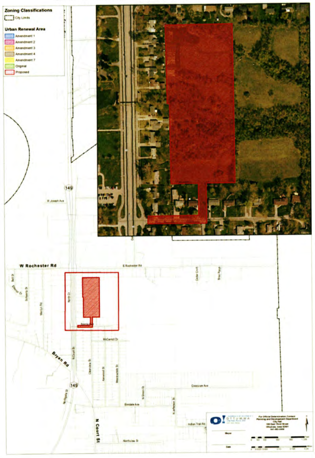
EXHIBIT B MAP OF BONITA URBAN RENEWAL AREA